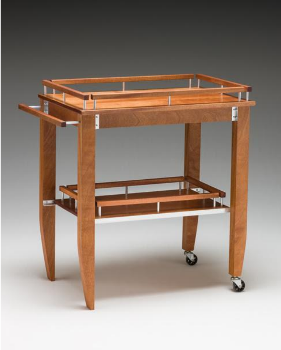
Jacqué Allen, Cocktails Anyone? , mahogany, aluminum, 33 x 19 x 32-1/4 inches