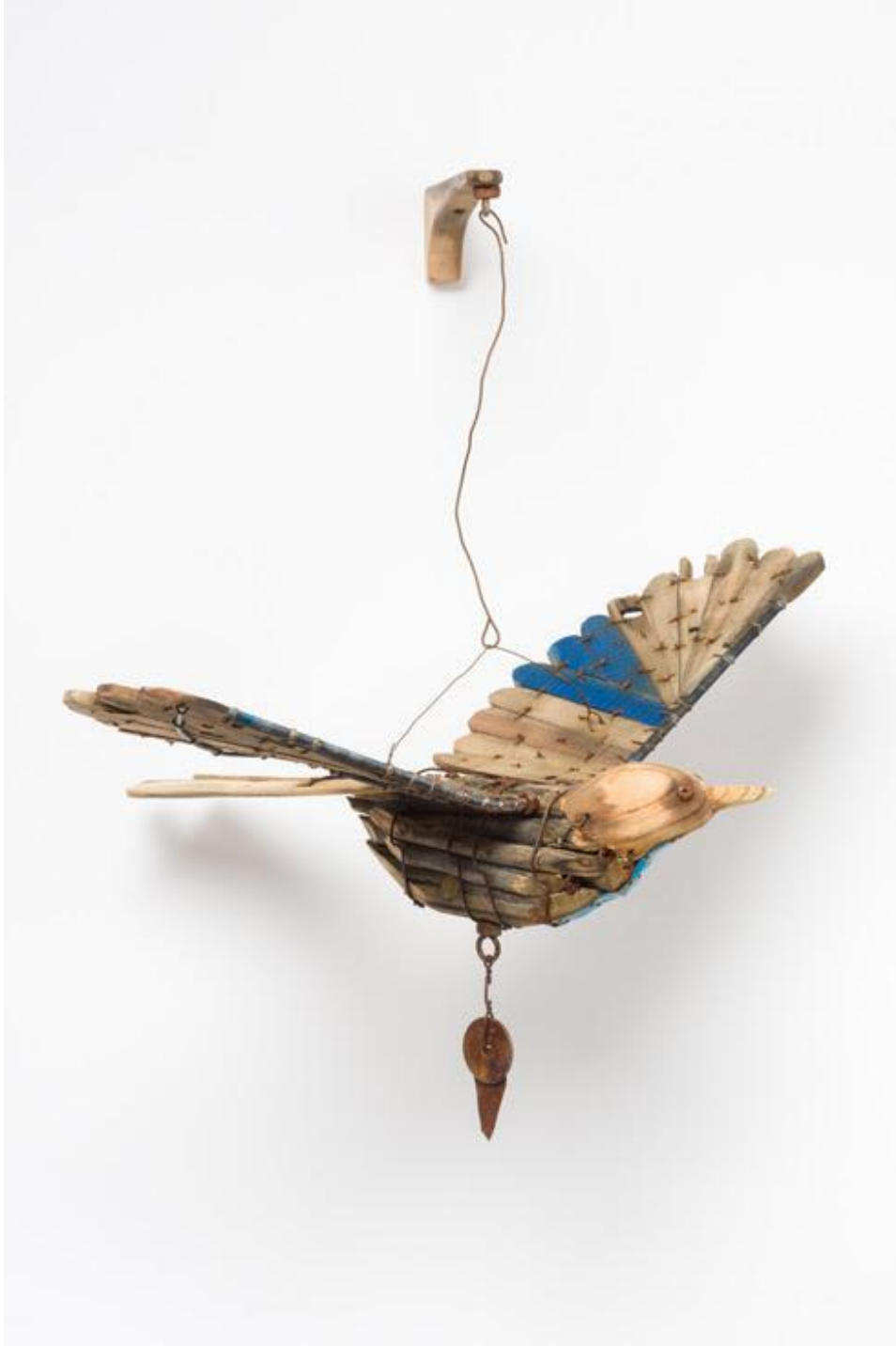
Geoffrey Gorman, Chihi , mixed media, found objects, 20 x 18 x 16 inches