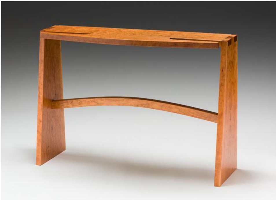
Doug Sigler, Library Table , cherry, 36 x 15 x 42 inches