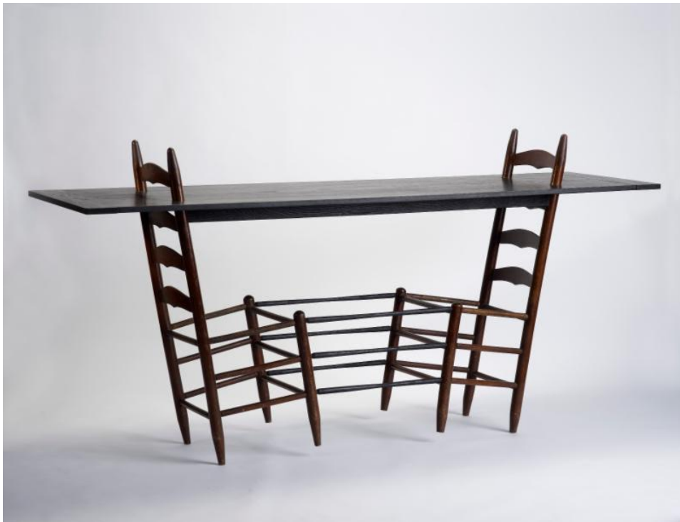
Tom Shields, Held-up , found chairs, ebonized oak, 43 x 22 x 72 inches

Below are just a few works in this year's benefit auction. See these pieces and more over auction weekend as you celebrate under the tent! Reserve your auction seats.