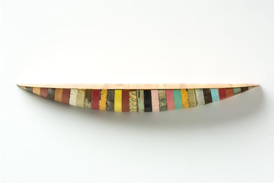
Ray Duffey, Small Wall Shelf , reclaimed wood, paint, 3-3/4 x 6-1/4 x 22-1/2 inches