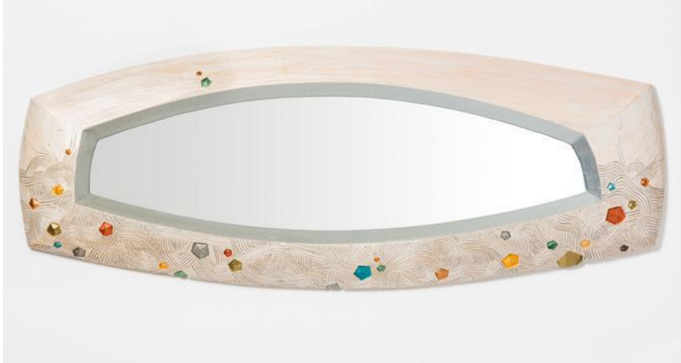
Brent Skidmore, Spaghetti with Lauren in April , basswood, mirror, graphite, acrylic paint, 17 x 45 x 2 inches